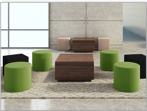
Creative & Stylish Addition To Any Lobby, Classroom, or Group Seating