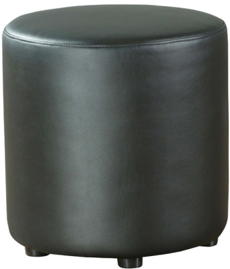
Black Bonded Leather Upholstery