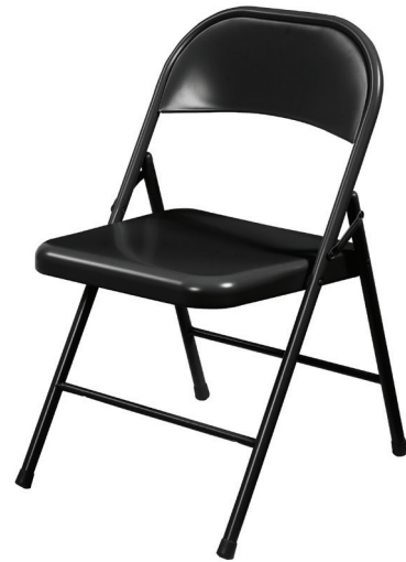
Pictured In Black