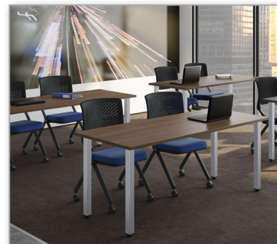
Comfortable & Attractive Chair That Complements Any Training Room